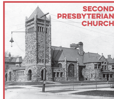
SECOND PRESBYTERIAN CHURCH

In 1887 the congressional members of the Second Presbyterian Church of Peoria elected